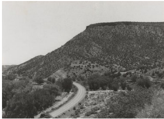
Georgia O'Keeffe, Road from Abiquiú , 1959–66, gelatin silver print, Georgia O'Keeffe Museum, Santa Fe.