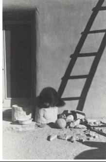
Georgia O'Keeffe, Bo II (Bo-Bo) , 1961, gelatin silver print, Georgia O'Keeffe Museum, Santa Fe.