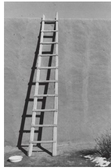
Georgia O'Keeffe, Ladder against Studio Wall with White Bowl , 1959–60, gelatin silver print, Georgia O'Keeffe Museum, Santa Fe.