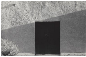
Georgia O'Keeffe, Salita Door , 1956–57, gelatin silver print, Georgia O'Keeffe Museum, Santa Fe.