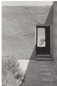
Georgia O'Keeffe, North Patio Corridor , 1956–57, gelatin silver print, Georgia O'Keeffe Museum, Santa Fe. © Georgia O'Keeffe Museum