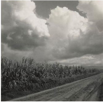
Georgia O'Keeffe, Sugar Cane Fields and Clouds , March 1939, gelatin silver print, Georgia O'Keeffe Museum, Santa Fe.