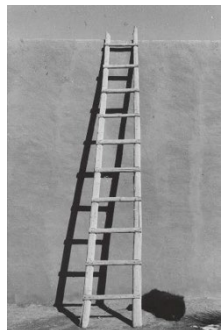
Georgia O'Keeffe, Ladder against Studio Wall with Black Chow (Bo-Bo) , 1959–60, gelatin silver print, Georgia O'Keeffe Museum, Santa Fe.