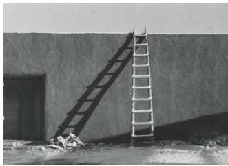
Georgia O'Keeffe, Ladder against Studio Wall in Snow , 1959–60, gelatin silver print, Georgia O'Keeffe Museum, Santa Fe.