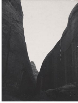
Georgia O'Keeffe, Forbidding Canyon, Glen Canyon , September 1964, black-and-white Polaroid, Georgia O'Keeffe Museum, Santa Fe.