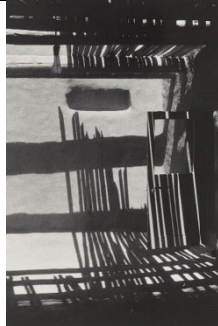
Georgia O'Keeffe, Roofless Room , 1959–60, gelatin silver print, Georgia O'Keeffe Museum, Santa Fe.