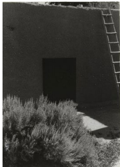
Georgia O'Keeffe, Salita Door, Patio , 1956–57, gelatin silver print, Metropolitan Museum of Art, New York. Anonymous Gift, 1977.