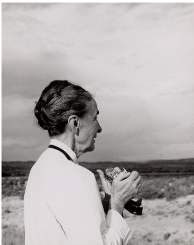
Todd Webb, Georgia O'Keeffe with Camera , 1959, printed later, inkjet print, Todd Webb Archive. © Todd Webb Archive, Portland, Maine, USA