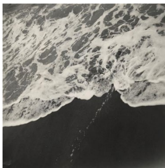
Georgia O'Keeffe, Wai'anapanapa Black Sand Beach , March 1939, gelatin silver print, Georgia O'Keeffe Museum, Santa Fe.