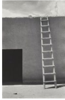
Georgia O'Keeffe, Ladder against Wall , 1961, gelatin silver print, Georgia O'Keeffe Museum, Santa Fe.