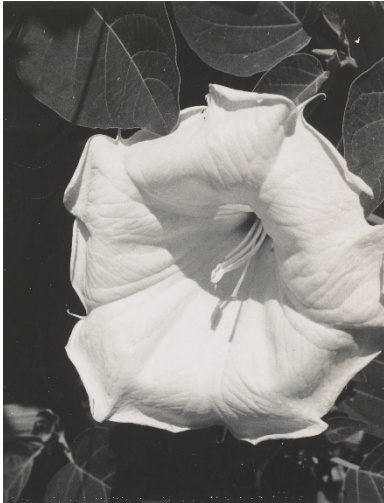
Georgia O'Keeffe, Jimsonweed (Datura stramonium) , 1964–68, black-and-white Polaroid, Georgia O'Keeffe Museum, Santa Fe. © Georgia O'Keeffe Museum

For high-resolution images, please contact Rebecca Mongeon at rmongeon@andover.edu