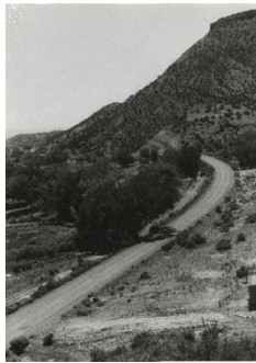
Georgia O'Keeffe, Road out Bedroom Window , likely 1957, gelatin silver print, Metropolitan Museum of Art, New York. Anonymous Gift, 1977. © 2022 Georgia O'Keeffe Museum / Artists Rights Society (ARS), New York