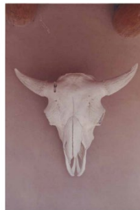
Georgia O'Keeffe, Skull, Ghost Ranch , 1961–72, chromogenic print, Georgia O'Keeffe Museum, Santa Fe.