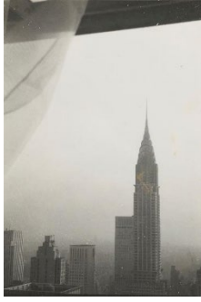
Georgia O'Keeffe, Chrysler Building from the Window of the Waldorf Astoria, New York , c. 1960, gelatin silver print, Georgia O'Keeffe Museum, Santa Fe.