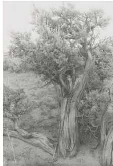
Georgia O'Keeffe, Big Sage (Artemisia tridentata) , 1957, gelatin silver print, Georgia O'Keeffe Museum, Santa Fe.