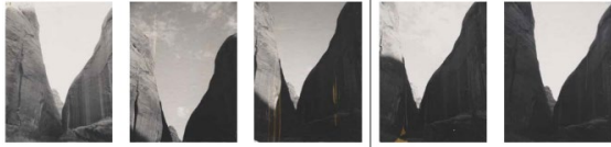
Georgia O'Keeffe, Forbidding Canyon, Glen Canyon , September 1964, black-and-white Polaroids, Georgia O'Keeffe Museum, Santa Fe.