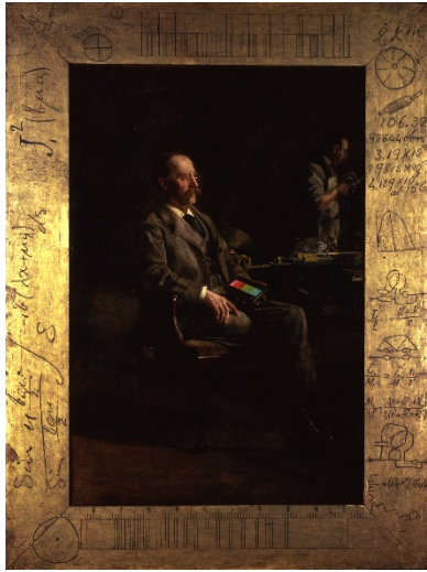
Thomas Eakins, Professor Henry A. Rowland , 1897