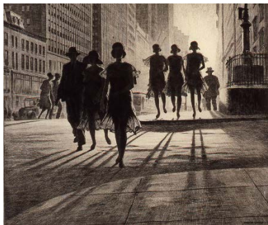
Martin Lewis, Shadow Dance , 1930

Addison Gallery of American Art, Phillips Academy, Andover, Massachusetts