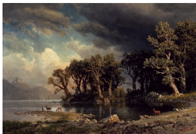
Albert Bierstadt, The Coming Storm , 1869

Addison Gallery of American Art, Phillips Academy, Andover, Massachusetts