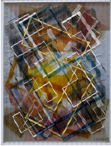
Irene Rice Pereira, Light is Gold , 1951

Glass, acrylic, lacquer, casein, and gold leaf, 30 1/8 x 23 1/4 inches